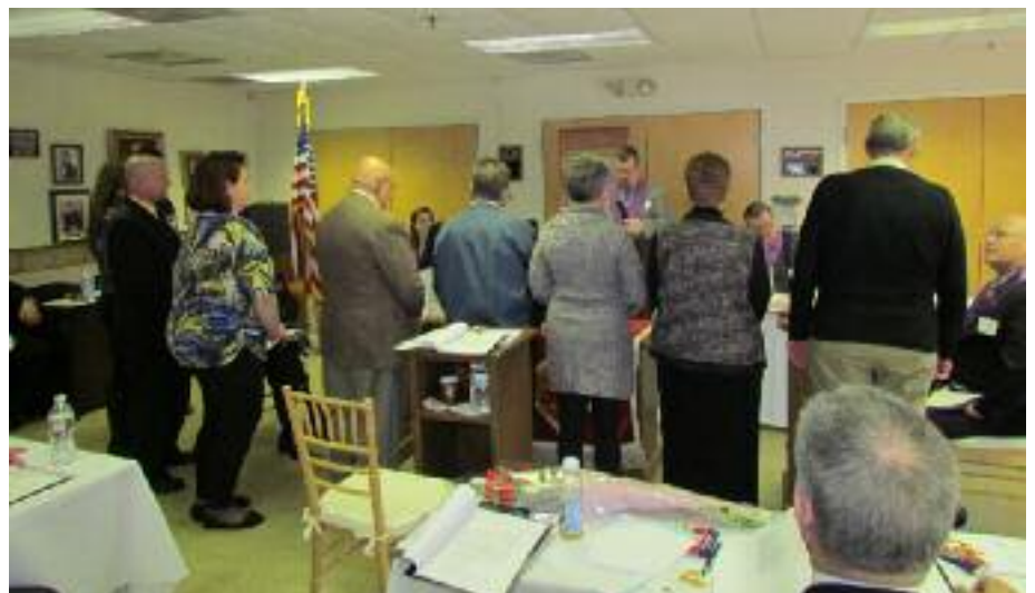
At right: Swearing in the newly elected delegates