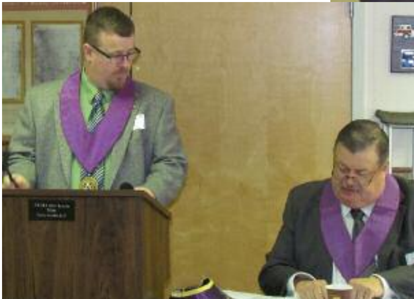
At left: Getting ready to open the 133rd M.E. Session