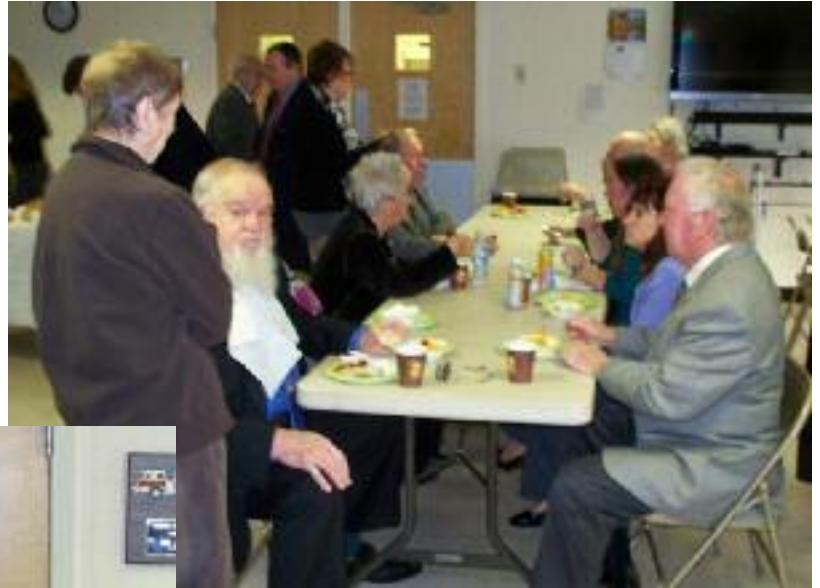
At right: Enjoying breakfast before the start of the Session