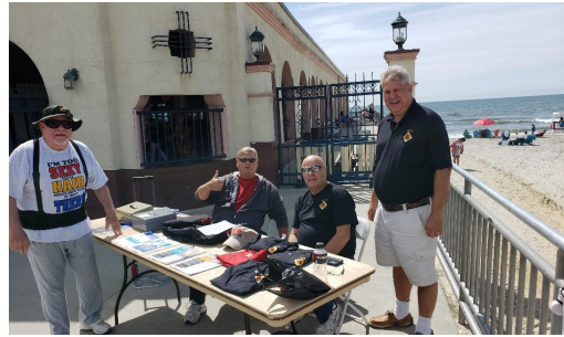
Ocean City Music Pier 2018