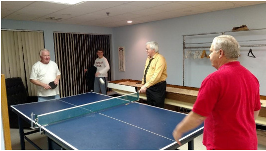
St. Johns ping pong tournament 2017