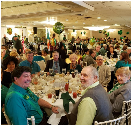
Haddon Assembly # 12 trip to Doolan's 2018