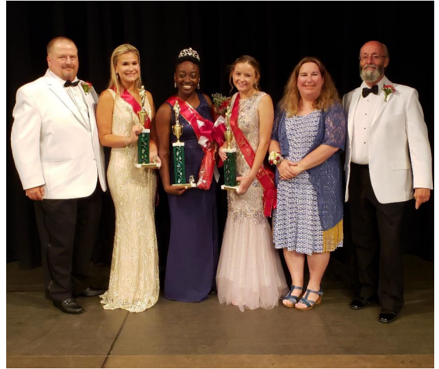
Miss Artisan Pageant 2019