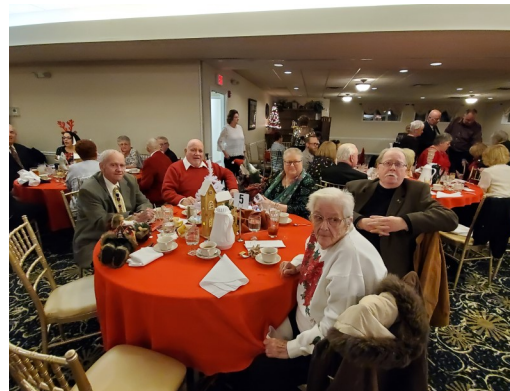
St. Johns/Artisans Christmas Party 2019