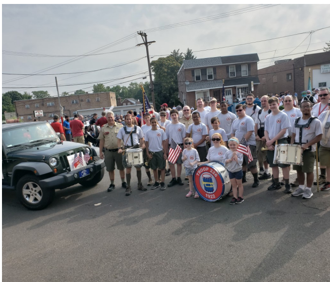
Some past events with Artisan Troop 226 and Pack 2226