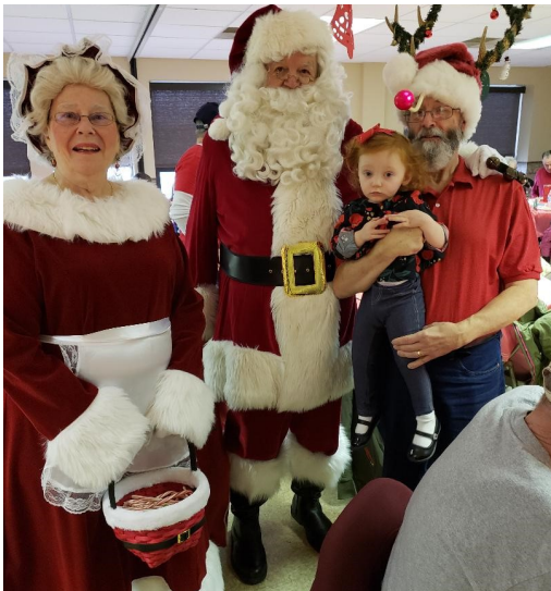
Brunch with Santa 2019