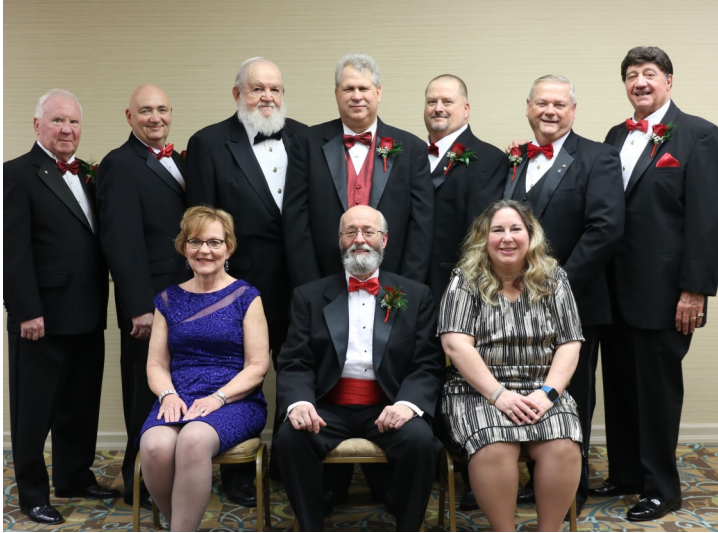
Board of Directors and Officers for 2020—2021

The office continues to be open and you must make an appointment before coming in to do business. All persons entering the building will need to wear a mask and have their temperature checked. These precautions are being taken as to local health department guidelines. Our meeting Hall will have to remain closed until we are allowed to resume our normal meeting schedule.