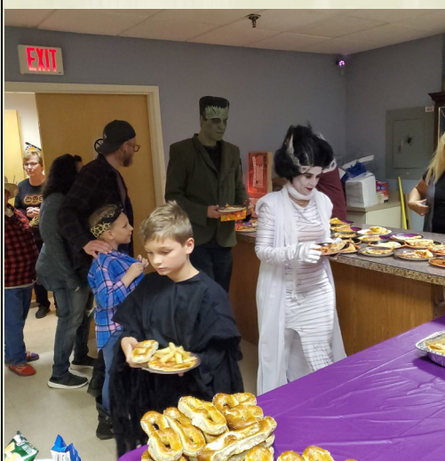
St. Johns Halloween Party