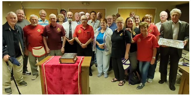
Most Excellent Family visitation to St. John's #28