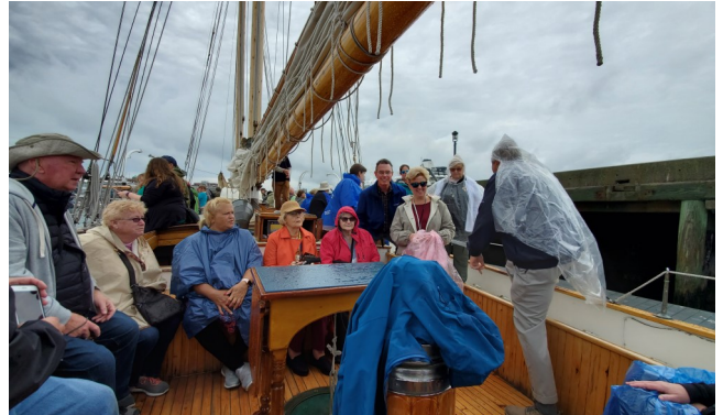
During the New England/Canadian cruise some of the St. Johns cruiser took a schooner cruise in the Casco bay.