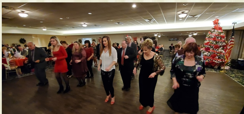
St. Johns/ Artisans Christmas Party