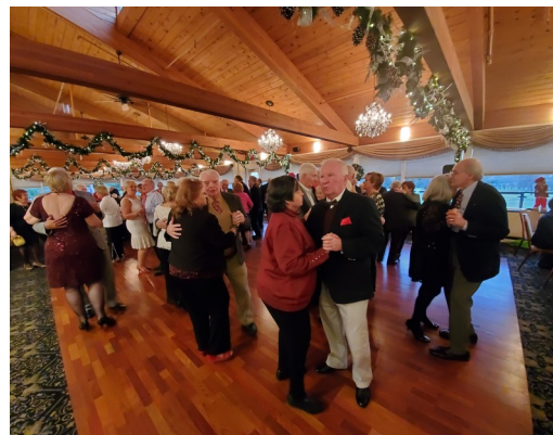
The dance floor was constantly filled at the New Jersey Boosters annual Christmas party.