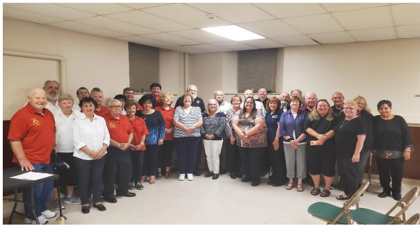
Most Excellent Family visitation to Haddon Assembly