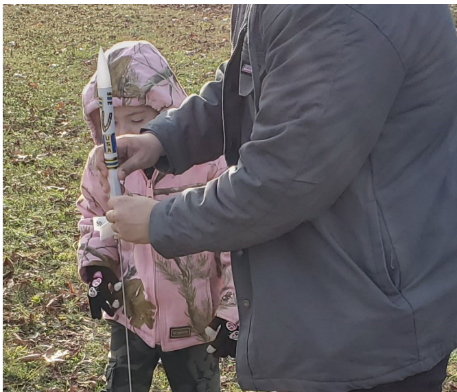
Artisan Troop 226 and Pack 2226 at the annual Hawk Mountain Turkey/Rocket weekend.