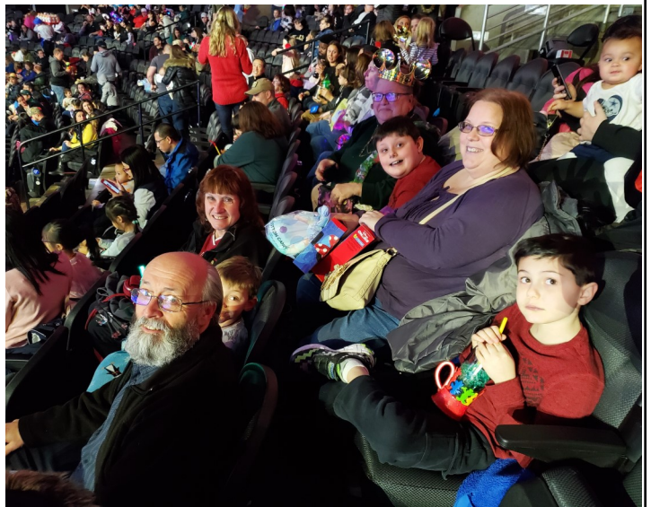
Disney on Ice was a fantastic event with kids of all ages enjoying the show.