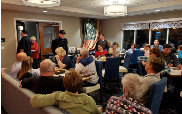
Our members were treated to a fantastic display of artifacts and a lecture by a historian at the hospitality room in Gettysburg.