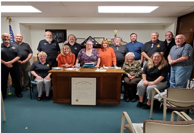
Most Excellent Family Visitation to the Tri-County Assembly.