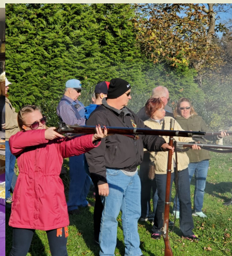
MEMA trip to Gettysburg