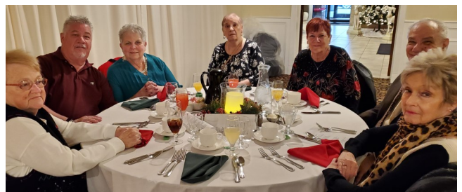
The officers of the Golden Artisans are shown at their annual Christmas party at the Cottage Green in Philadelphia.