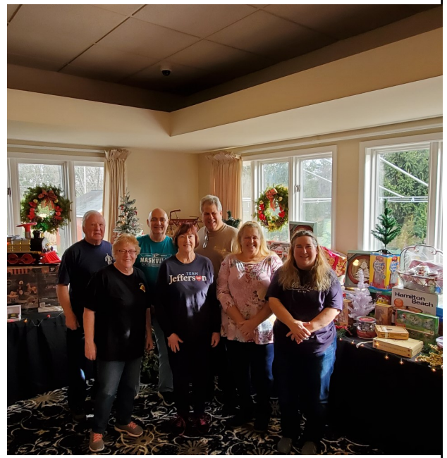
The St. Johns Elves were very busy setting up the room before the annual St. Johns/Artisans Christmas Party.