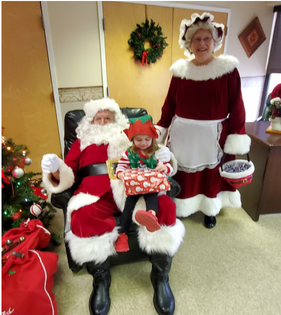
Children of all ages really enjoyed the visit by Santa Claus and Mrs. Claus.