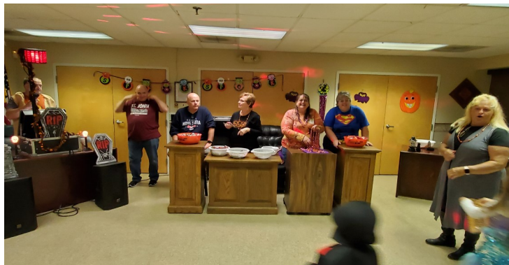
The annual St. John's Junior Halloween party was well attended and a big hit for the Junior and Senior Artisans who attended this fun filled event.