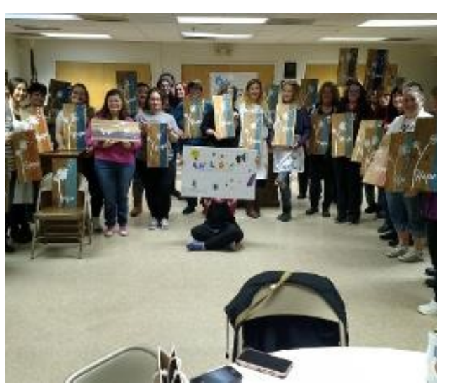
Team Sofia paint party 2018