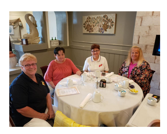
Miss Artisan breakfast 2019