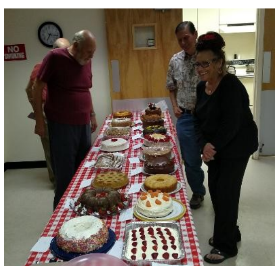
St. John's Ladies Night 2016