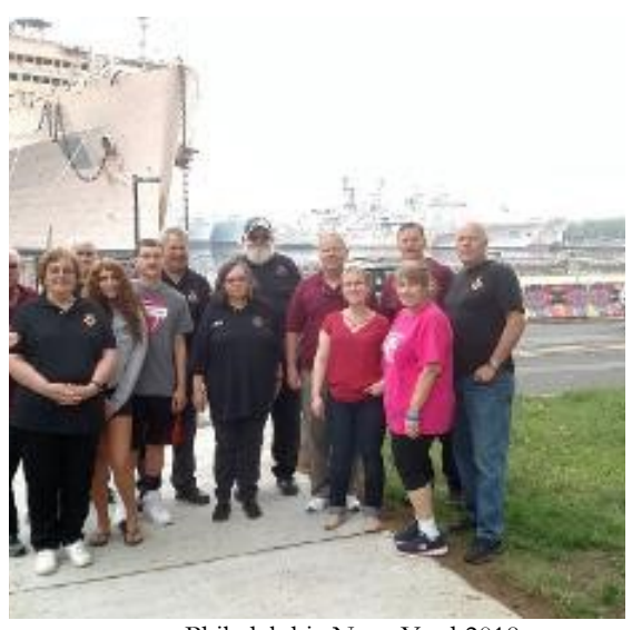
Philadelphia Navy Yard 2018