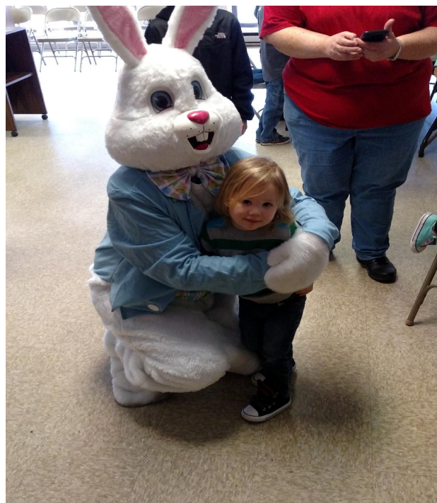
Easter egg hunt 2018.