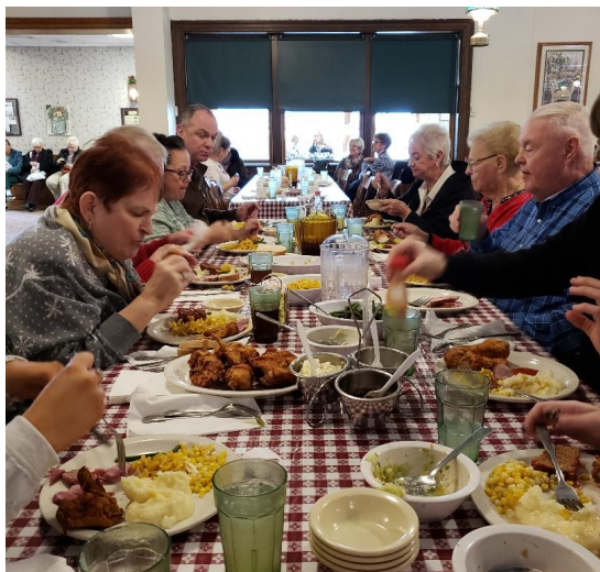
Sharing a delicious Home style dinner at the Good N Plenty Restaurant in Lancaster PA, 2018.