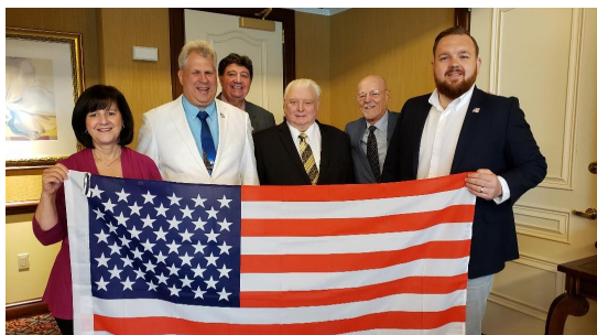
New Jersey/New York flag Day celebration in 2019.