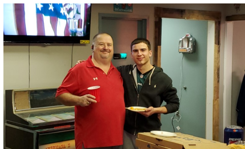
St. John's Super Bowl party 2020.