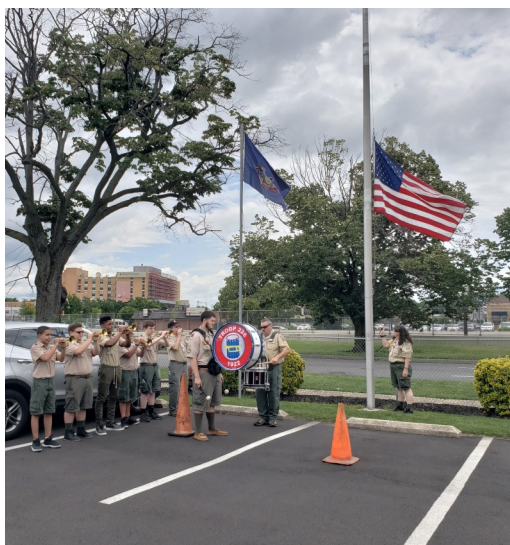
2018 Flag Day celebration with troop 226.