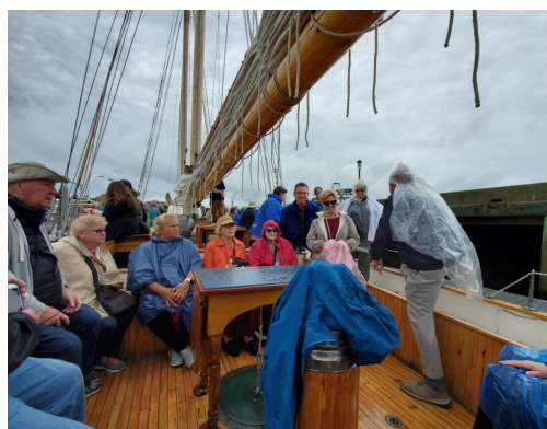
St. John's Cruisers enjoying a windjammer cruise around the Casco Bay in Portland Maine 2019.