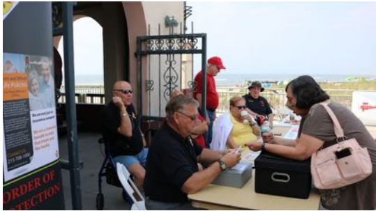
Some of our Extension Committee members outside the Music Pier on Saturday morning.