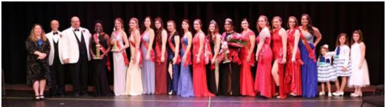
Miss Artisan Pageant 2018