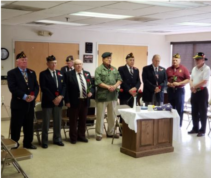
Members of the Artisans American Legion Post at the annual Memorial Day breakfast and memorial service held at the Hall.