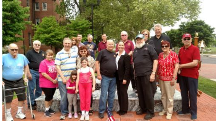
Pictured are just some of our Brother and Sister Artisans who attended the Armed Forces Day service at the Chapel of the Four Chaplains at the Philadelphia Navy Yard.