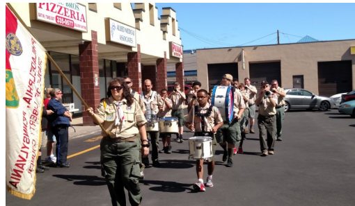
Artisan Troop 226 performing at the Artisan open house in 2017.