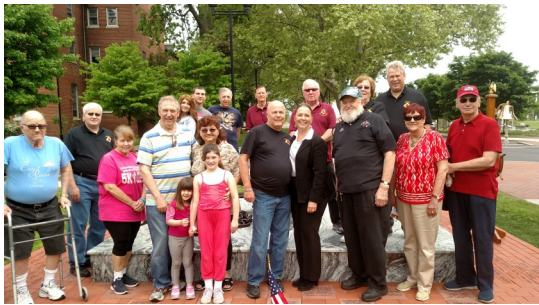
Chapel of the four Chaplins open house and memorial service 2018.