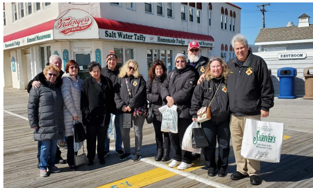
Some of the members of the Extension Committee are pictured outside of the vendors and storeowners day at the Flanders Hotel in Ocean City, New Jersey. The committee members were able to get commitments from some new store owners to participate in our annual treasure hunt this upcoming summer.