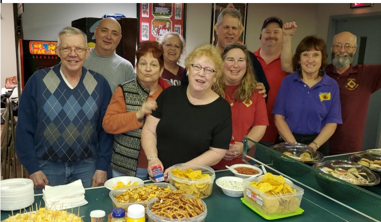
The St. John's Super Bowl party was held right after the Most Excellent Session at the Artisans game room.