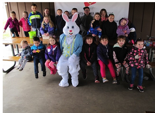
Easter lunch and egg hunt at Neshaminy State Park in 2016.