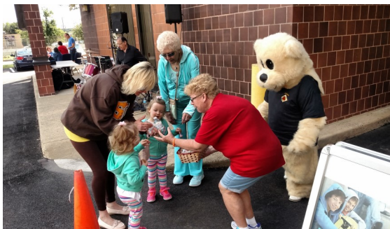
The Artisan Bear and helpers at the Artisan awareness day 2016.