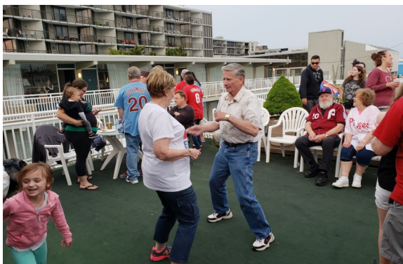
The Artisans Ocean City weekend hospitality room roof top party at the old Impala Hotel in 2017.