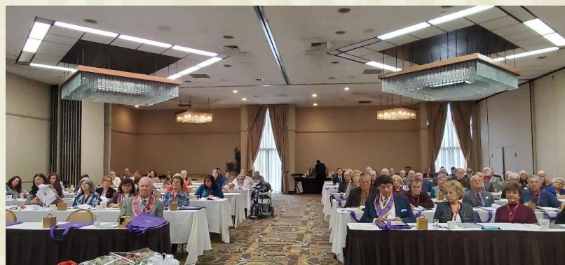
The delegates are pictured at the 2020 Most Excellent Session that was held on February 1st at the Radisson Hotel in Trevoise PA.