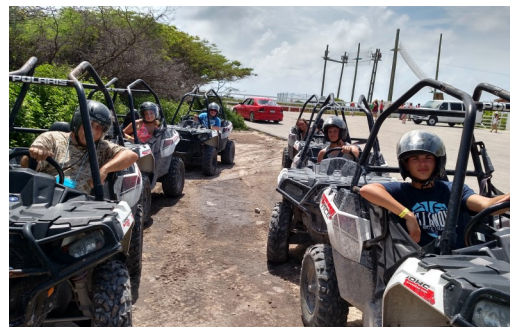
St. John's Cruisers in Grand Turk 2017.