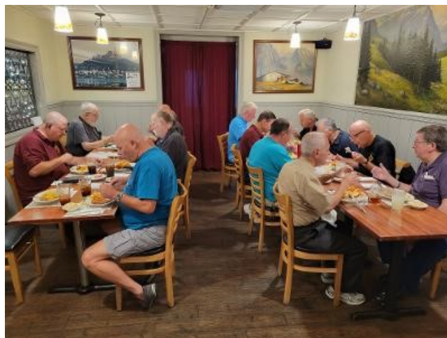
St. John's Executive meeting hard at work at the Austrian Village planning for their upcoming meeting and MEMA visitation in September.