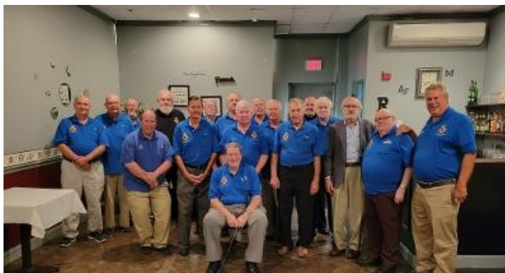
The first meeting of the Dining Club in 2021