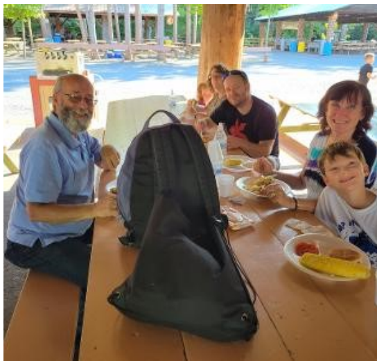
The Spindler Family enjoying the picnic