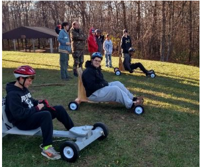
Some past events with Artisan Troop 226 and Pack 2226