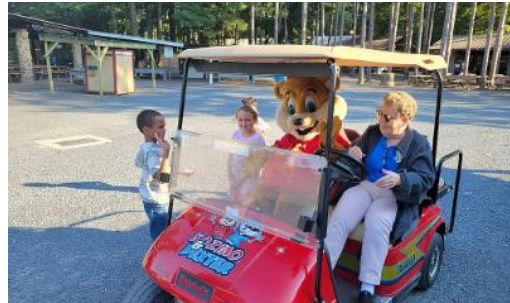
Kozmo greets some of our Junior Artisans