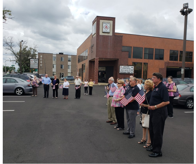
Flag Day celebration 2019