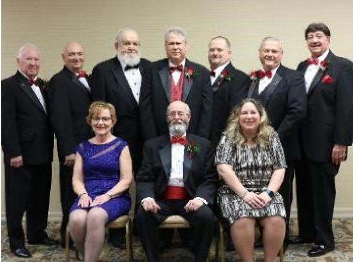
Board of Directors and Officers for 2020—2021

Even with the Hall shut down for activities and meetings there is still a lot of good old fashioned fraternalism in the air. Many of our members have been calling each other and checking up on their Brother and Sister Artisans. The pandemic has not dampened the spirit of Artisanship and everyone is looking forward to the day that we will be able to resume having our meetings and great family activities. The office is open for business and we just ask that you call for ahead for an appointment and wear a mask when you visit. There has been many upgrades to our facilities over the past few months and many long standing projects have been completed. We can't wait to see you at our first post covid meeting next year.