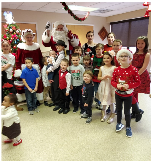
Brunch with Santa 2019