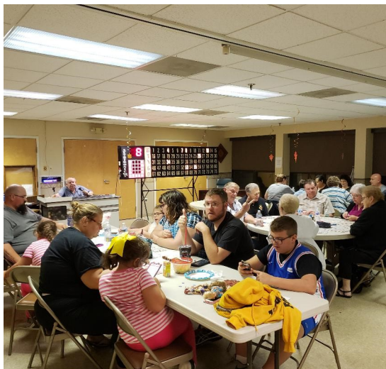
GAA Bingo 2018