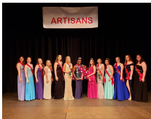
Miss Artisan Pageant 2019