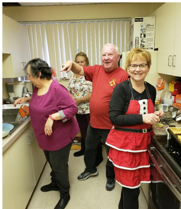
Santa's helpers preparing brunch 2018