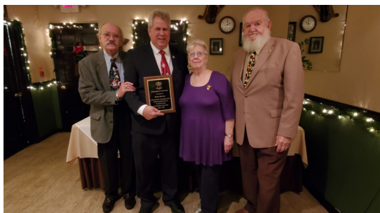
Officers of the Philadelphia Fraternals 2019