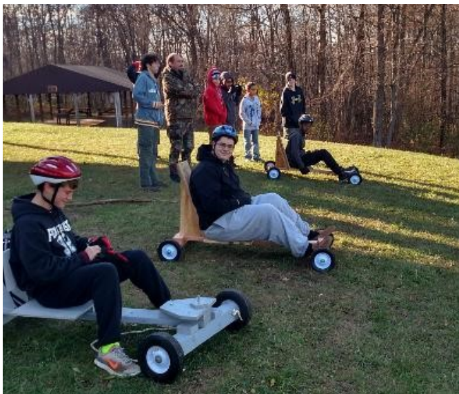
Some past events with Artisan Troop 226 and Pack 2226