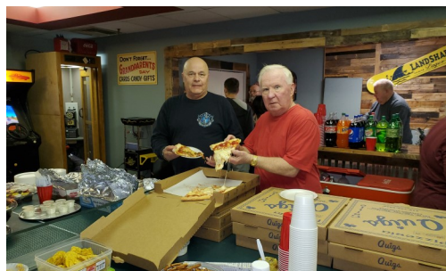
St. John's Super Bowl party 2020