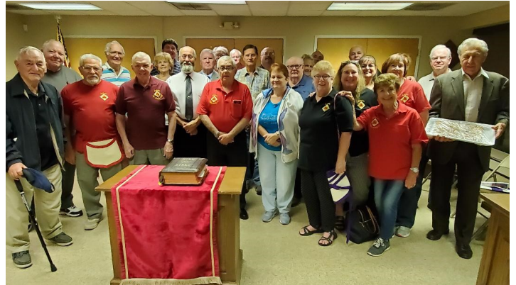
The Most Excellent Family visited St. Johns' Assembly and enjoyed a delicious dinner.